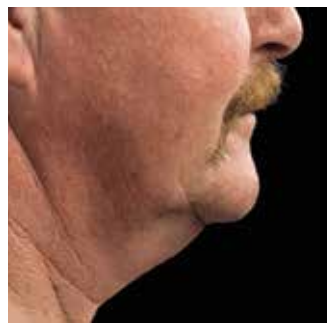
12 WEEKS AFTER Second CoolSculpting Session