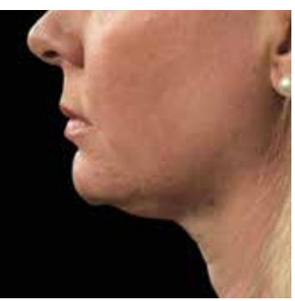
12 WEEKS AFTER Second CoolSculpting Session