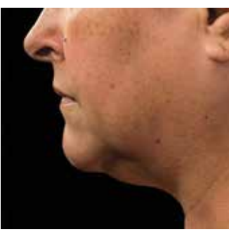
12 WEEKS AFTER Second CoolSculpting Session