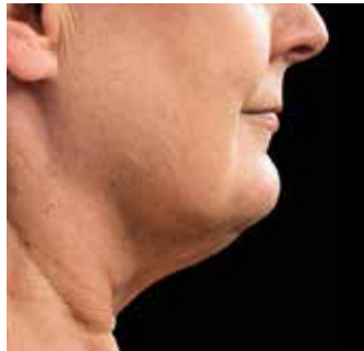
12 WEEKS AFTER Second CoolSculpting Session